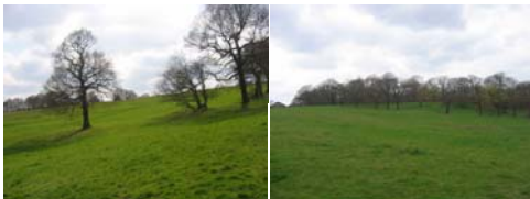
Enjoy the Nature Conservation areas