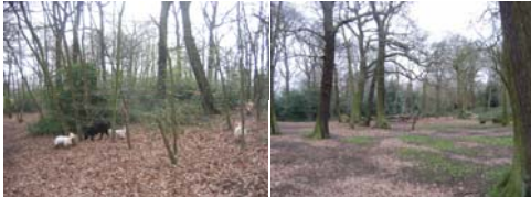
Safe place to walk your dog without traffic